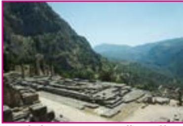
Delphi - Tempio d'Apollo